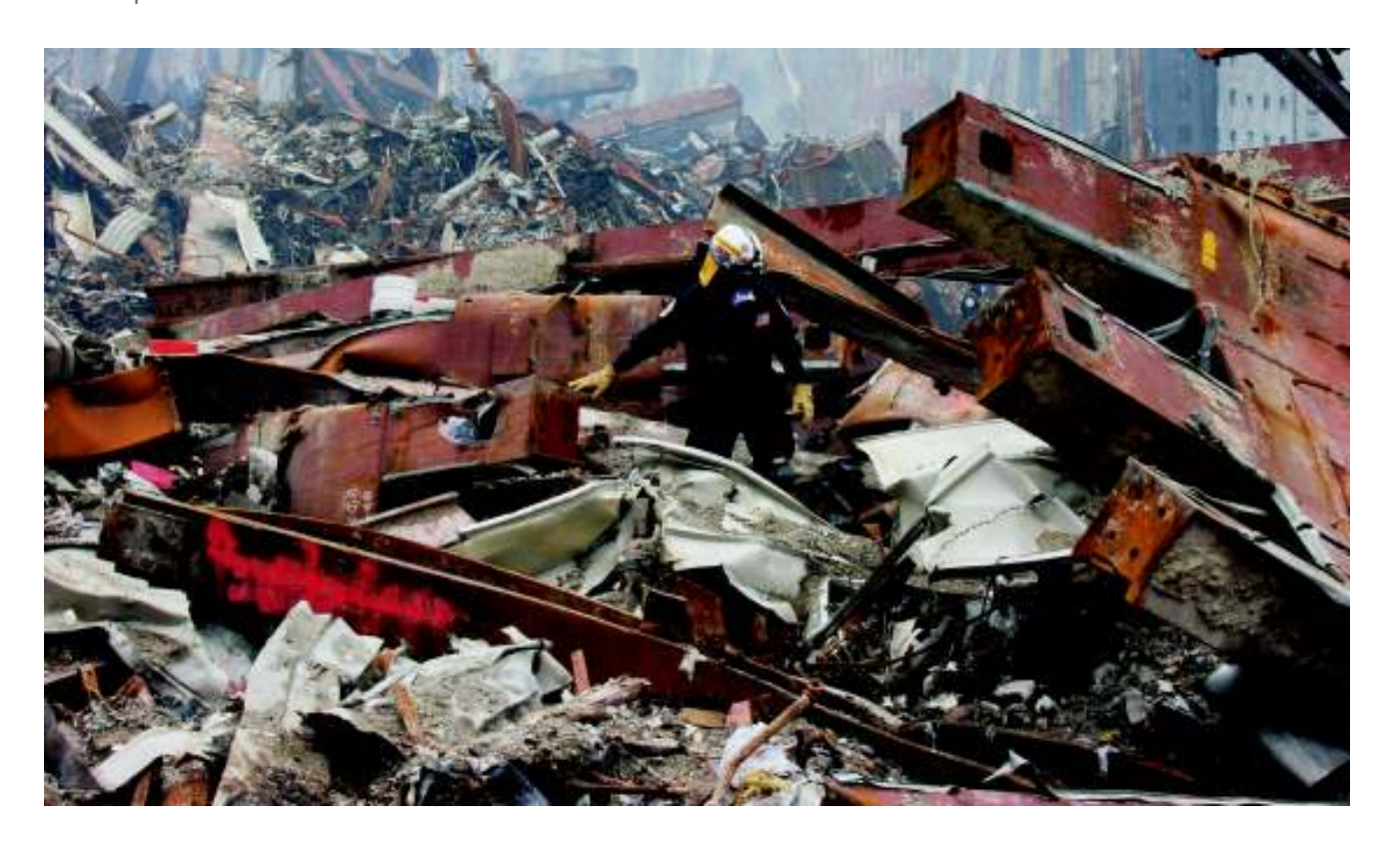
The towers look as if they were put through a giant shredding machine.