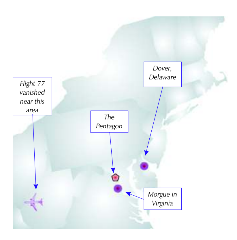
Figure 1-2 The Pentagon and morgues

The U.S. government tells us that Tim McVeigh filled several containers with a mixture of fertilizer and fuel oil, put them in a truck, and parked the truck in front of a government building. When the containers exploded, it shattered the front the building, killing more than 100 people.