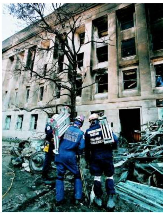
Only one piece of engine was Figure 1-3 found at the Pentagon

The wings are made of carbon fiber. If the carbon fiber burned, that would explain the lack of airplane debris A Global Hawk has one, small engine Figure 1-4 The Global Hawk