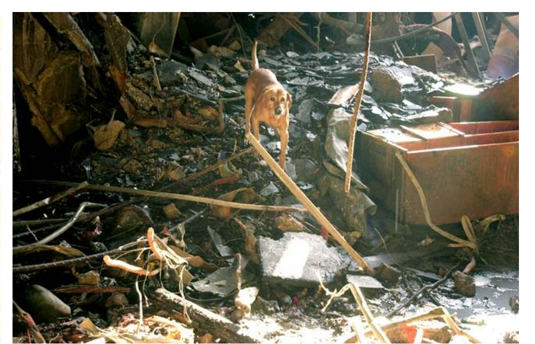
US Military photos