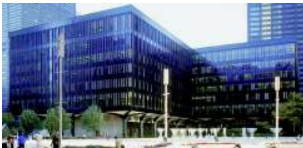
Building 4 of the World Trade Center