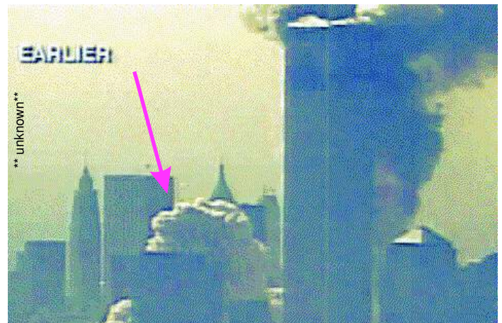
Figure 1-1 The red arrow points to a large cloud near Building 5, 6, and 7 as the South Tower collapsed. This cloud shot upwards at very high speed.