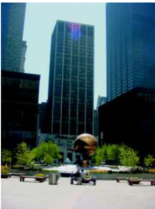
The courtyard of the World Trade Center

Millions of Americans are appalled at the number of citizens who mindlessly followed Hitler and Saddam Hussein. Nevertheless, take note that Americans are behaving the same way if they refuse to look critically at their own government. The patriots who chant "USA! USA! USA!", "Support George Bush!", and "You are either with us or against us!" should be chanting "Think! Learn! Investigate!", "Demand competent politicians!" and "It is OK in the USA to question the government!"