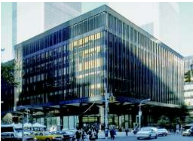
Building 5 of the World Trade Center