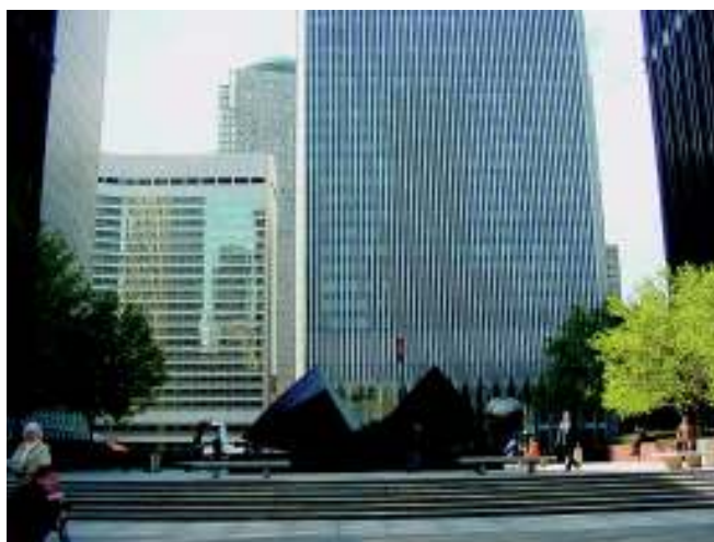
The hotel (Building 3) at left, rear. The North tower is in the center, and the South Tower is at the extreme left edge.

The US military action in Afghanistan is as suspicious as the superficial investigation of the World Trade Center collapse, thereby fueling conspiracy theories. Our government claimed that we bombed Afghanistan to search for Osama and his terrorist camps, but how do we locate Osama by flying high above the clouds and dropping bombs