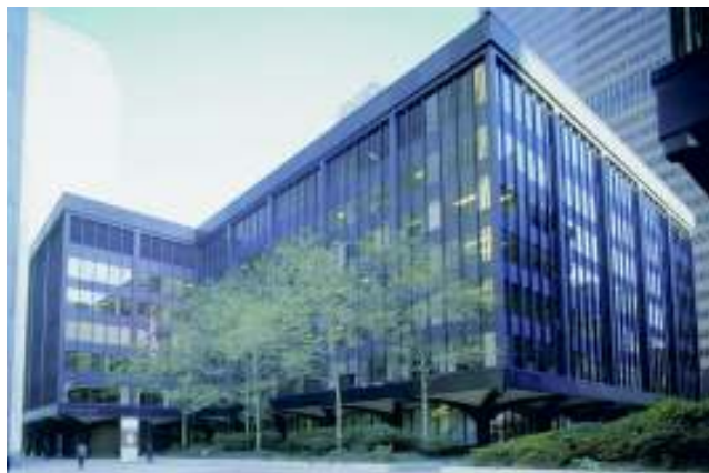
Building 6 of the World Trade Center